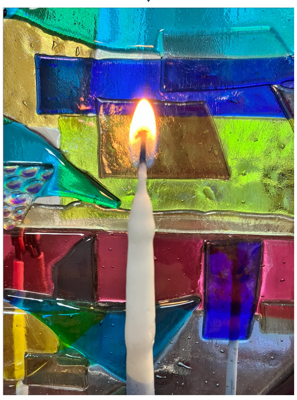
TEMPLE ADATH B'NAI ISRAEL EVANSVILLE, INDIANA